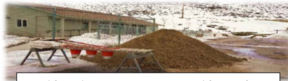
Sand & Sand Bags @ Teton County Road & Levee (733-7190) & Town of Jackson Public Works (733-3079)