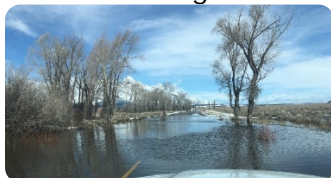
Flooding of Spring Gulch Rd, 2018